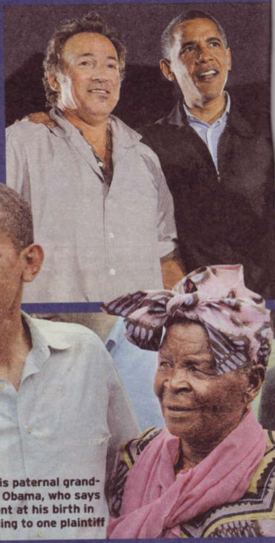
Barack with his paternal grandmother Sarah Obama, who says she was present at his birth in Kenya, according to one plaintiff

Two Bosses? Obama was supported by rocker Bruce Springsteen, whose hit song Born in the USA brings an ironic twist to the President-elect's shocking citizenship controversy